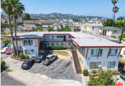
924 N Kingsley Dr Los Angeles CA 90029

Sale Price: $1,850,000 GBA: 6,676 Sq.Ft. Year Built: 1956 Total Units: 8 Price Per Sq.Ft.: $277.11 Price Per Unit: $231,250 Date Closed: 09/29/2023