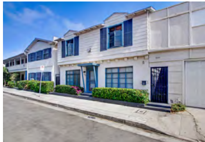
5441 Flemish Ln Los Angeles CA 90029

Sale Price: $1,950,000 GBA: 6,768 Sq.Ft. Year Built: 1923 Total Units: 10 Price Per Sq.Ft.: $288.12 Price Per Unit: $195,000 Date Closed: 06/23/2023