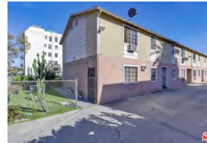
5442 Virginia Ave Los Angeles CA 90029

Sale Price: $2,390,000 GBA: 6,764 Sq.Ft. Year Built: 1948 Total Units: 8 Price Per Sq.Ft.: $353.34 Price Per Unit: $298,750 Date Closed: 10/12/2023