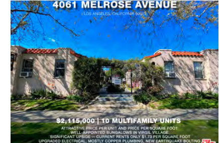
4061 Melrose Ave Los Angeles CA 90029

Sale Price: $1,750,000 GBA: 5,000 Sq.Ft. Year Built: 1962 Total Units: 7 Price Per Sq.Ft.: $350.00 Price Per Unit: $250,000 Date Closed: 07/11/2023