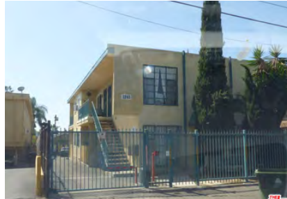
1245 N Harvard Blvd Los Angeles CA 90029

Sale Price: $1,850,000 GBA: 6,676 Sq.Ft. Year Built: 1956 Total Units: 8 Price Per Sq.Ft.: $277.11 Price Per Unit: $231,250 Date Closed: 09/29/2023